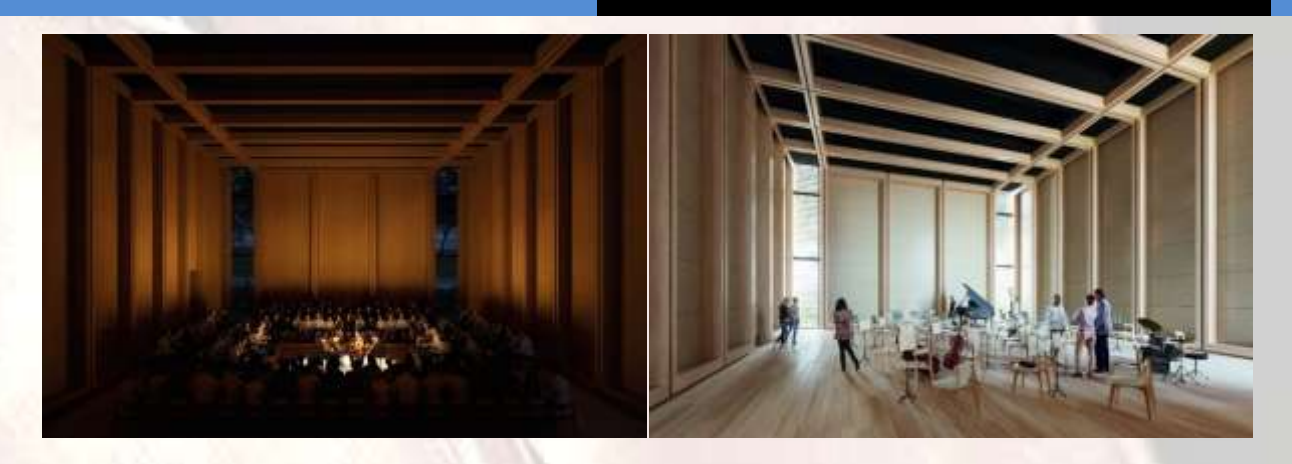
\hbox{ }\\